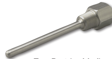
Two Part (welded) Thermowell