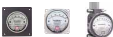
Flush ...Surface...or Pipe Mounted

With the optional A-610 Pipe Mounting Kit they may be conveniently installed on horizontal or vertical 1-1/4" - 2" pipe. Although calibrated for vertical position, many ranges above 1" may be used at any angle by simply re-zeroing. However, for maximum accuracy, they must be calibrated in the same position in which they are used. These characteristics make Magnehelic® gages ideal for both stationary and portable applications. A 4-9/16" hole is required for flush panel mounting. Complete mounting and connection fittings plus instructions are furnished with each instrument.