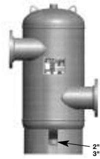
3" THROUGH 12" R AND RL MODELS 2" PLUG FOR RL 3" PLUG FOR R

INSTALLER: PLEASE LEAVE THIS MANUAL FOR THE OWNER'S USE.