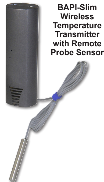
BAPI-Slim Wireless Temperature Transmitter with Remote Probe Sensor

The external sensor's ribbon cable can easily fit between the door seal or through hole with FEP cable without affecting appliance efficiency. The temperature is then transmitted at 30-second intervals to the receiver with a measurement range of -40 to 185°F (-40 to 85°C).