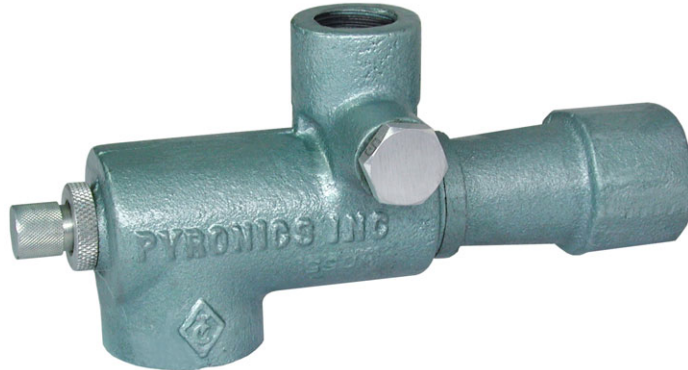
#16 MF MULTIFLO-MIXER

Multiflo Mixers are patented design adjustable high efficiency proportional mixers. The energy of the air passing through the jet produces a suction to entrain a combustible gas and deliver the mixture to the burners.